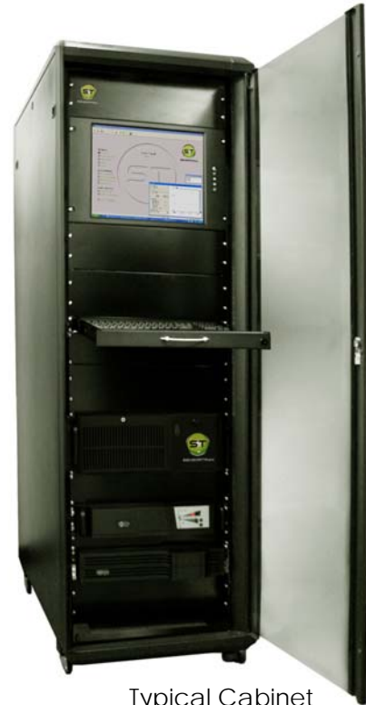
Typical Cabinet (with optional extras)

In addition to offering bespoke cabinets to meet exacting client's specifications, SensorTran's offers a standard floor-standing DTS Cabinet to complement its range of DTS products.